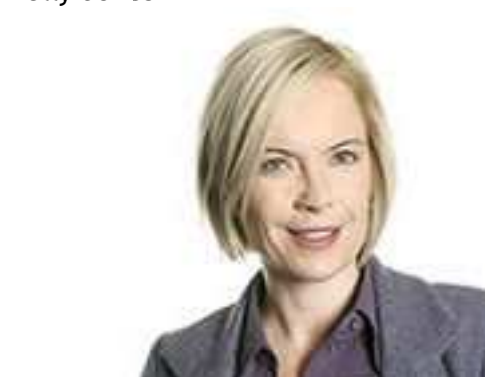
"...an amazing voice..." Mariella Fostrup Radio 4