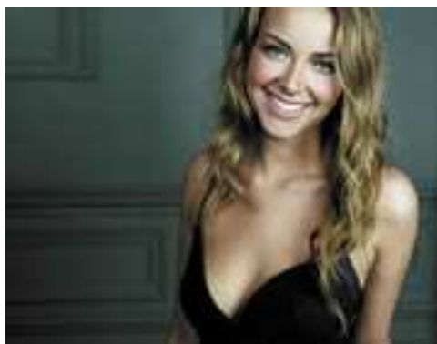
"You are bloody brilliant!" Charlotte Church