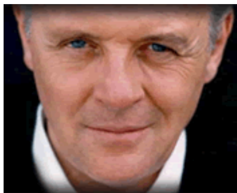
"What a beautiful voice" Sir Anthony Hopkins

Telephone: +44 (0) 1446 754350 Mobile: +44 (0) 7966 151584 Email: info@aubreymusic.co.uk Web: www.aubreymusic.co.uk