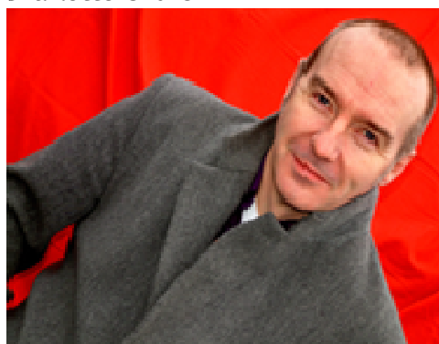
"Aubrey can sing anything!" Midge Ure