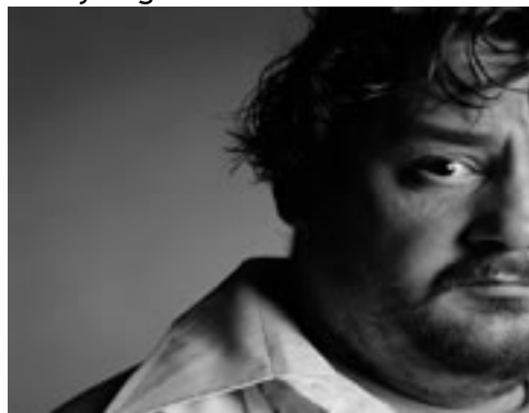
"I can now die a happy man..." - Johnny Vegas