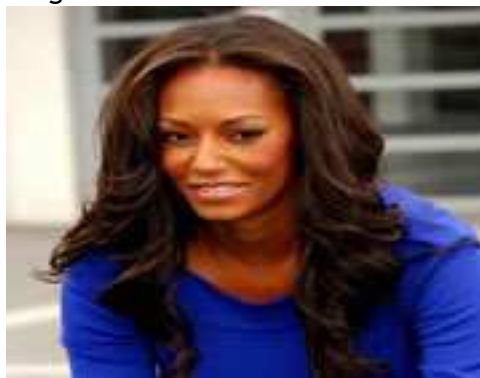
"Aubrey that was fantastic!" Mel B - The Spice Girls